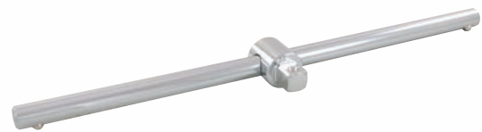
Sliding T Handle

Federal Spec. CDA 39-GP-12b U.S. GGG-W-641E ANSI B107.10M