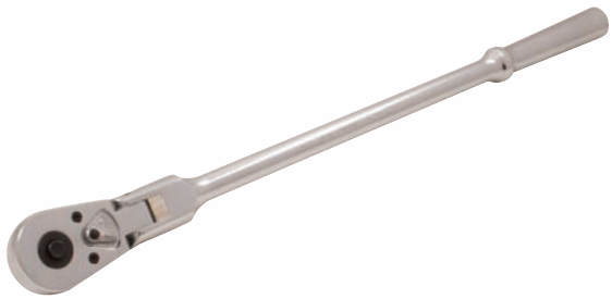
Reversible Ratchet - Flexible Head